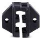
Spare die, for CRIMPFOX 50R

Replacement die - CRIMPFOX 50R/DIE - 1212042