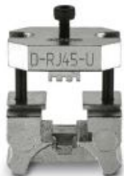
Die, for unshielded RJ45 plugs, universal

Please be informed that the data shown in this PDF Document is generated from our Online Catalog. Please find the complete data in the user's documentation. Our General Terms of Use for Downloads are valid ( http://phoenixcontact.com/download )