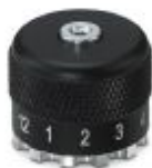
Locator for CRIMPFOX-TC MP6

Spare locator - CRIMPFOX-TC MP LOC - 1045123