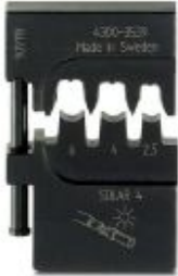
Die, for MC4 solar connectors, lateral entry, 2.5 - 6 mm 2

Please be informed that the data shown in this PDF Document is generated from our Online Catalog. Please find the complete data in the user's documentation. Our General Terms of Use for Downloads are valid ( http://phoenixcontact.com/download )