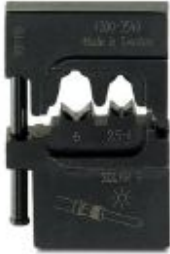
Die, for MC3 solar connectors, lateral entry, 2.5 ... 6 mm 2

Please be informed that the data shown in this PDF Document is generated from our Online Catalog. Please find the complete data in the user's documentation. Our General Terms of Use for Downloads are valid ( http://phoenixcontact.com/download )