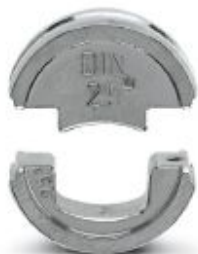
Die (pair), for CRIMPFOX-C50, for insulated ring cable lug 25 mm 2 , oval crimp

Please be informed that the data shown in this PDF Document is generated from our Online Catalog. Please find the complete data in the user's documentation. Our General Terms of Use for Downloads are valid ( http://phoenixcontact.com/download )