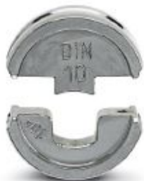
Die (pair), for CRIMPFOX-C50, for insulated ring cable lug 10 mm 2 , oval crimp

Please be informed that the data shown in this PDF Document is generated from our Online Catalog. Please find the complete data in the user's documentation. Our General Terms of Use for Downloads are valid ( http://phoenixcontact.com/download )