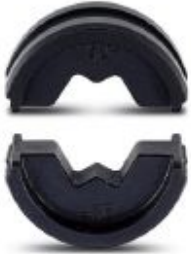
Die (pair), for CRIMPFOX-C50, for copper tube lug 35 mm 2 , WM crimp

Please be informed that the data shown in this PDF Document is generated from our Online Catalog. Please find the complete data in the user's documentation. Our General Terms of Use for Downloads are valid ( http://phoenixcontact.com/download )