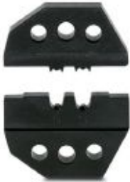
Spare die for CRIMPFOX-TC 2,5

Please be informed that the data shown in this PDF Document is generated from our Online Catalog. Please find the complete data in the user's documentation. Our General Terms of Use for Downloads are valid ( http://phoenixcontact.com/download )