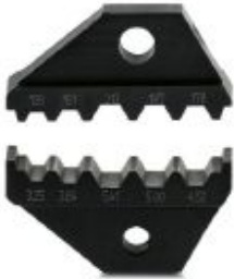
Spare die for CRIMPFOX-FO 5,41

Please be informed that the data shown in this PDF Document is generated from our Online Catalog. Please find the complete data in the user's documentation. Our General Terms of Use for Downloads are valid ( http://phoenixcontact.com/download )