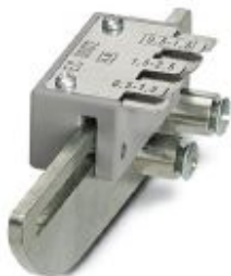
Sleeve receiver for CF 500 crimping machine, for slip-on sleeves (SCF 4,8...), 0.5 - 2.5 mm 2 , width: 4.8 mm

Please be informed that the data shown in this PDF Document is generated from our Online Catalog. Please find the complete data in the user's documentation. Our General Terms of Use for Downloads are valid ( http://phoenixcontact.com/download )