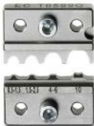
Die for crimping machine CF 500, for cable lugs (C-RC... and C-FC...) 0.5 ... 10 mm 2

Please be informed that the data shown in this PDF Document is generated from our Online Catalog. Please find the complete data in the user's documentation. Our General Terms of Use for Downloads are valid ( http://phoenixcontact.com/download )