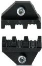
Die for crimping machine CF 500, for ferrules (A... and AI...) 10.16 and 25 mm 2

Please be informed that the data shown in this PDF Document is generated from our Online Catalog. Please find the complete data in the user's documentation. Our General Terms of Use for Downloads are valid ( http://phoenixcontact.com/download )