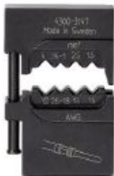
Die, for Crimpfox-M, for turned contacts 0.5 ... 4 mm 2 , packed in a serial storage box

Please be informed that the data shown in this PDF Document is generated from our Online Catalog. Please find the complete data in the user's documentation. Our General Terms of Use for Downloads are valid ( http://phoenixcontact.com/download )