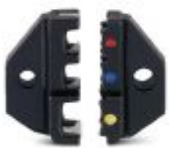
Spare die for CRIMPFOX-RCI 6

Replacement die - CRIMPFOX-RCI 6/DIE - 1212058