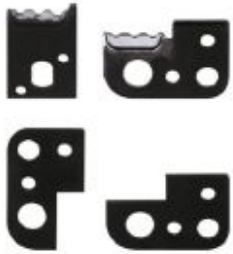
Replacement die for CRIMPFOX-1,6/2,5-ED-2,50

Please be informed that the data shown in this PDF Document is generated from our Online Catalog. Please find the complete data in the user's documentation. Our General Terms of Use for Downloads are valid ( http://phoenixcontact.com/download )