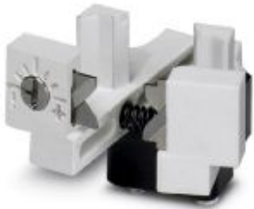
Adjustable spare stripping knife, 0.5 mm 2 , for crimping machine CF 3000

Please be informed that the data shown in this PDF Document is generated from our Online Catalog. Please find the complete data in the user's documentation. Our General Terms of Use for Downloads are valid ( http://phoenixcontact.com/download )