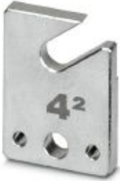
Accessories for CF 1000 and CF 1000-10 stripping and crimping machine, separating plate for 4.0 mm 2 sleeves

Please be informed that the data shown in this PDF Document is generated from our Online Catalog. Please find the complete data in the user's documentation. Our General Terms of Use for Downloads are valid ( http://phoenixcontact.com/download )