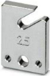
Accessories for CF 1000 stripping and crimping machine, separating plate for 2.5 mm 2 sleeves

Please be informed that the data shown in this PDF Document is generated from our Online Catalog. Please find the complete data in the user's documentation. Our General Terms of Use for Downloads are valid ( http://phoenixcontact.com/download )