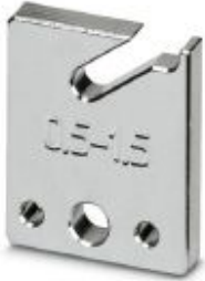
Accessories for CF 1000 stripping and crimping machine, separating plate for 0.5 ... 1.5 mm 2 sleeves

Please be informed that the data shown in this PDF Document is generated from our Online Catalog. Please find the complete data in the user's documentation. Our General Terms of Use for Downloads are valid ( http://phoenixcontact.com/download )