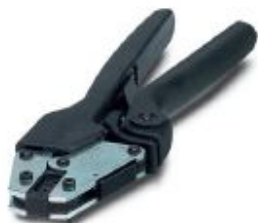
Crimping pliers, for CK 4,0... contacts, for 4.0 - 6.0 mm 2 conductor cross sections

Please be informed that the data shown in this PDF Document is generated from our Online Catalog. Please find the complete data in the user's documentation. Our General Terms of Use for Downloads are valid ( http://phoenixcontact.com/download )