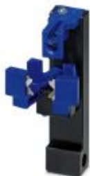
Replacement processing insert 2.5 mm 2 , for the crimping device CF 3000-2,5

Please be informed that the data shown in this PDF Document is generated from our Online Catalog. Please find the complete data in the user's documentation. Our General Terms of Use for Downloads are valid ( http://phoenixcontact.com/download )