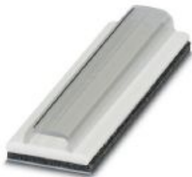
Marker carriers, transparent, unlabeled, mounting type: adhesive, lettering field size: 30 x 4 mm

Please be informed that the data shown in this PDF Document is generated from our Online Catalog. Please find the complete data in the user's documentation. Our General Terms of Use for Downloads are valid ( http://phoenixcontact.com/download )