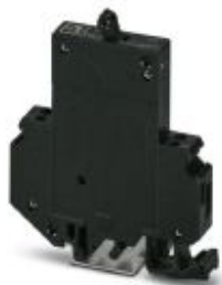
Thermomagnetic circuit breaker, 1-pos., fast blow, 1 N/C contact, with universal foot for mounting on NS 32 or NS 35

Please be informed that the data shown in this PDF Document is generated from our Online Catalog. Please find the complete data in the user's documentation. Our General Terms of Use for Downloads are valid ( http://phoenixcontact.com/download )