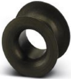
Adapter sleeve, nominal current: 4 A, color: brown

Please be informed that the data shown in this PDF Document is generated from our Online Catalog. Please find the complete data in the user's documentation. Our General Terms of Use for Downloads are valid ( http://phoenixcontact.com/download )