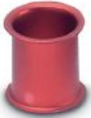
Adapter sleeve, nominal current: 10 A, color: red

Please be informed that the data shown in this PDF Document is generated from our Online Catalog. Please find the complete data in the user's documentation. Our General Terms of Use for Downloads are valid ( http://phoenixcontact.com/download )