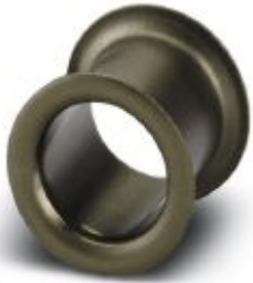
Adapter sleeve, nominal current: 4 A, color: brown

Please be informed that the data shown in this PDF Document is generated from our Online Catalog. Please find the complete data in the user's documentation. Our General Terms of Use for Downloads are valid ( http://phoenixcontact.com/download )