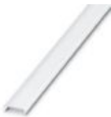
Cover, transparent, unlabeled, lettering field size: 1000 x 15 mm

Cover - CARRIER-EMP (1000X15) COVER - 0829520