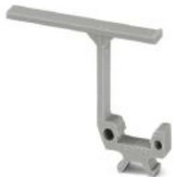
Group marking label, snaps into terminal center for push-in terminal blocks ...1.5/S, Lettering field 25 x 3.5 mm, pitch 3.5 mm, labeled with EML (24 x 3)R

Please be informed that the data shown in this PDF Document is generated from our Online Catalog. Please find the complete data in the user's documentation. Our General Terms of Use for Downloads are valid ( http://phoenixcontact.com/download )