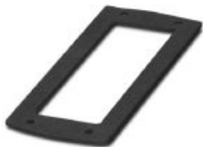
Flat gasket made of NBR, size B16

Please be informed that the data shown in this PDF Document is generated from our Online Catalog. Please find the complete data in the user's documentation. Our General Terms of Use for Downloads are valid ( http://phoenixcontact.com/download )