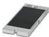
Magazine for the THERMOMARK CARD printer, for accommodating UCT sheets (UCT-WMT...)

Magazine - THERMOMARK CARD-UCT-MAG7 - 0801734