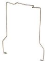
Spring lock, for mechanical locking in the case of overhead mounting, 1-pos.

Please be informed that the data shown in this PDF Document is generated from our Online Catalog. Please find the complete data in the user's documentation. Our General Terms of Use for Downloads are valid ( http://phoenixcontact.com/download )