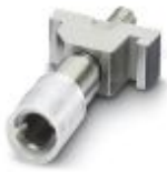
Female test connector, color: green

Female test connector - PSBJ-GSK/S GN - 0305352