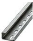
DIN rail perforated, G profile, width: 32 mm, height: 15 mm, acc. to EN 60715, material: Steel, galvanized, passivated with a thick layer, length: 2000 mm, color: silver

DIN rail perforated - NS 32 PERF 2000MM - 1201002