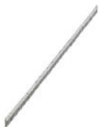
Jumper, number of positions: 100, color: silver

Please be informed that the data shown in this PDF Document is generated from our Online Catalog. Please find the complete data in the user's documentation. Our General Terms of Use for Downloads are valid ( http://phoenixcontact.com/download )