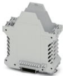
Component housing, length: 99 mm, color: light gray

Please be informed that the data shown in this PDF Document is generated from our Online Catalog. Please find the complete data in the user's documentation. Our General Terms of Use for Downloads are valid ( http://phoenixcontact.com/download )