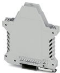
Component housing, length: 99 mm, color: light gray

Please be informed that the data shown in this PDF Document is generated from our Online Catalog. Please find the complete data in the user's documentation. Our General Terms of Use for Downloads are valid ( http://phoenixcontact.com/download )