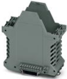
Component housing, color: gray

Please be informed that the data shown in this PDF Document is generated from our Online Catalog. Please find the complete data in the user's documentation. Our General Terms of Use for Downloads are valid ( http://phoenixcontact.com/download )