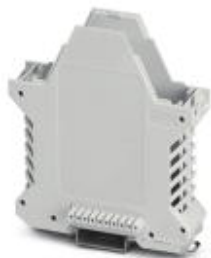
Component housing, length: 99 mm, color: light gray

Please be informed that the data shown in this PDF Document is generated from our Online Catalog. Please find the complete data in the user's documentation. Our General Terms of Use for Downloads are valid ( http://phoenixcontact.com/download )