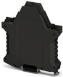
Component housing, color: black

Please be informed that the data shown in this PDF Document is generated from our Online Catalog. Please find the complete data in the user's documentation. Our General Terms of Use for Downloads are valid ( http://phoenixcontact.com/download )