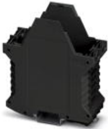
Component housing, length: 99 mm, Lower part, color: black, width: 45 mm, height: 114.5 mm

Please be informed that the data shown in this PDF Document is generated from our Online Catalog. Please find the complete data in the user's documentation. Our General Terms of Use for Downloads are valid ( http://phoenixcontact.com/download )