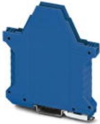
Component housing, length: 99 mm, Lower part, color: blue, width: 12.5 mm, height: 114.5 mm

Please be informed that the data shown in this PDF Document is generated from our Online Catalog. Please find the complete data in the user's documentation. Our General Terms of Use for Downloads are valid ( http://phoenixcontact.com/download )