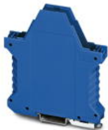
Component housing, length: 99 mm, Lower part, color: blue, width: 17.5 mm, height: 114.5 mm

Please be informed that the data shown in this PDF Document is generated from our Online Catalog. Please find the complete data in the user's documentation. Our General Terms of Use for Downloads are valid ( http://phoenixcontact.com/download )