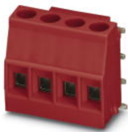
PCB terminal block

Please be informed that the data shown in this PDF Document is generated from our Online Catalog. Please find the complete data in the user's documentation. Our General Terms of Use for Downloads are valid ( http://phoenixcontact.com/download )