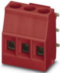
PCB terminal block

Please be informed that the data shown in this PDF Document is generated from our Online Catalog. Please find the complete data in the user's documentation. Our General Terms of Use for Downloads are valid ( http://phoenixcontact.com/download )