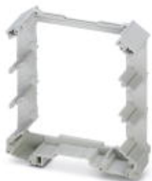
Complete housing, length: 99 mm, Central part, color: light gray, width: 45 mm

Please be informed that the data shown in this PDF Document is generated from our Online Catalog. Please find the complete data in the user's documentation. Our General Terms of Use for Downloads are valid ( http://phoenixcontact.com/download )