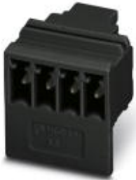
PCB headers, number of positions: 4, pitch: 3.5 mm

Please be informed that the data shown in this PDF Document is generated from our Online Catalog. Please find the complete data in the user's documentation. Our General Terms of Use for Downloads are valid ( http://phoenixcontact.com/download )