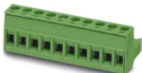
The figure shows a 10-pos. version of the product in green

PCB connector, nominal current: 12 A, number of positions: 12, pitch: 5 mm, connection method: Screw connection with tension sleeve, color: green, contact surface: Tin