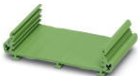
The figure shows the variant UM 45-Profil CM

Panel mounting base, length: 1000 mm, open, Lower part, Cross connection: without bus connector, color: green, width: 1000 mm, number of positions cross connector: not relevant, Note: required profile length = PCB length - 3.6 mm