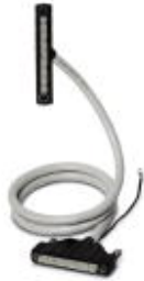
Assembled round cable with two molded 50-pos. socket strips (1:1 connection). Cable length: 3.0 m

Please be informed that the data shown in this PDF Document is generated from our Online Catalog. Please find the complete data in the user's documentation. Our General Terms of Use for Downloads are valid ( http://phoenixcontact.com/download )