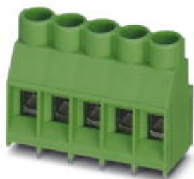
PCB terminal block, nominal current: 32 A, nom. voltage: 630 V, pitch: 6.35 mm, number of positions: 2, connection method: Screw connection with tension sleeve, mounting: Wave soldering, color: green

Please be informed that the data shown in this PDF Document is generated from our Online Catalog. Please find the complete data in the user's documentation. Our General Terms of Use for Downloads are valid ( http://phoenixcontact.com/download )